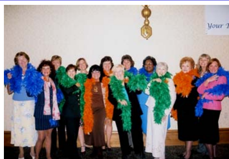
2005 Enterprising Women of Florida

Women's World at World Golf Village: Wednesday October 18, 2006 8am to 4pm